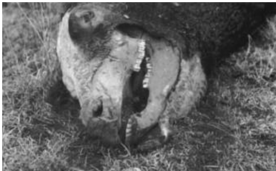
Close-up of steer's head, showing excision of jaw tissue, bone and teeth.

It is interesting that Puerto Rico is now having episodes of